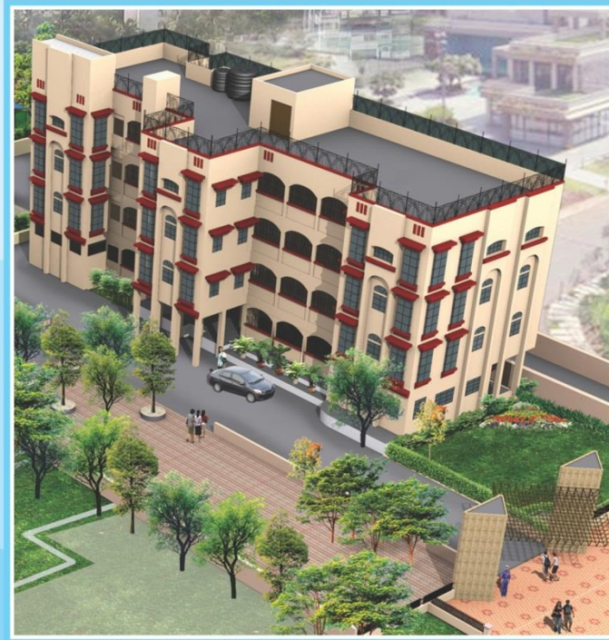
IMS - MAIN BUILDING

B. P. H. E. Society's Motto "Not things but men, I dare you !"