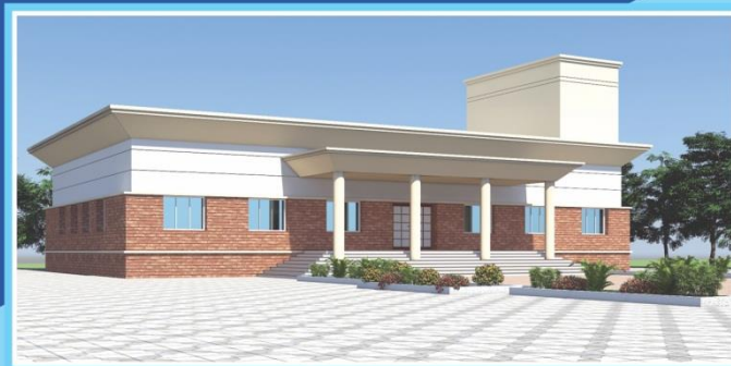
IMS - SKILL ENHANCEMENT & ENTREPRENEURSHIP DEVELOPMENT CENTRE (SEEDC) BUILDING

B. P. H. E. Society's Motto "Not things but men, I dare you !"